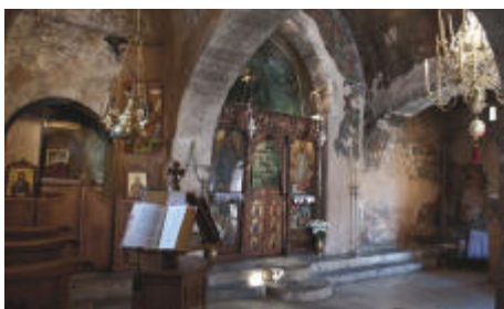
Keras Kardiotissa Monastery, Greece

In 1865, the Redemptorist Order restored the icon to a place of honor in Rome's Church of St. Alphonso and gave the picture the title it has held until this day: Our Lady of Perpetual Help. Entrusted by Pope Pius IX to make Mary better known worldwide, the Redemptorists began a devotion honoring her under this title, with novena prayers said on Wednesday of each week. This devotion is still kept to this day.