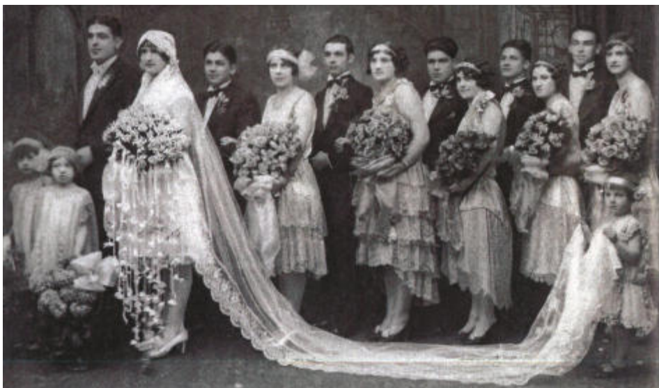
The photo above appeared in a recent issue of Reminisce.com magazine as part of a feature on "true love tales." The couple met as childhood sweethearts - and were married at St. Mary's in 1928. The photo was submitted to Reminisce.com by their daughter, a resident of Reno, NV.