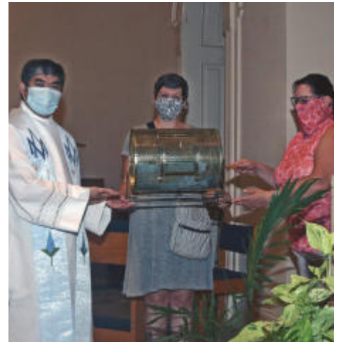
St. Mary's Feast Day and Mega Raffle drawings went on as scheduled this year, without events to accompany them. Rain on August 15 brought this year's Feast Day Mass and Raffle into Church from the Pavilion. Both raffles were very successful, thanks to the ongoing generosity of supporters, even through the challenging days of the coronavirus pandemic.