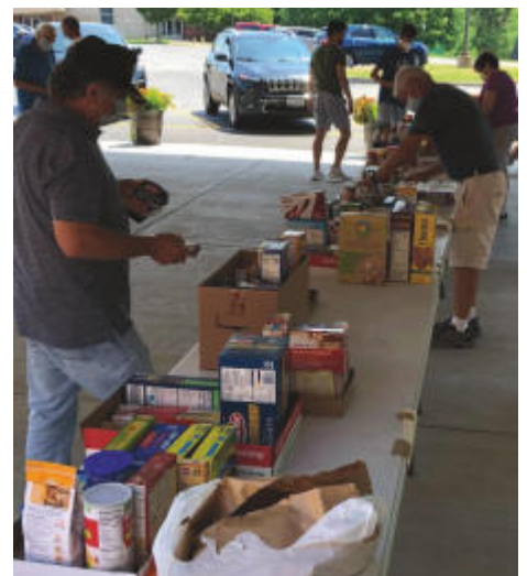
A Food Drive on July 18 helped replenish supplies at St. Mary's food pantry, which had been depleted during the course of the coronavirus pandemic. Pantry items are available for those in need, by contacting the Rectory.