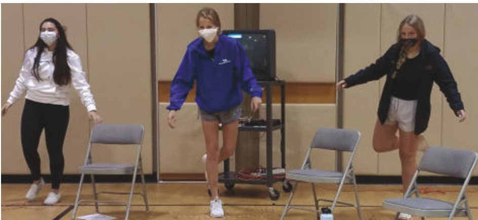
Covid 19: a real balancing act! Confirmation will be celebrated at St. Mary's this Fall. (The date had not been announced by the Diocese of Buffalo, as of Messenger deadline.) For eight consecutive weeks this summer, candidates were sent taped sessions and handouts, as they prepared for Confirmation. They worked at home, and met twice in socially-distanced conditions under the Pavilion outside Church to review what they were learning. They also participated in two separate retreat sessions to allow for social distancing. Blessings to our Confirmation Class of 2020!