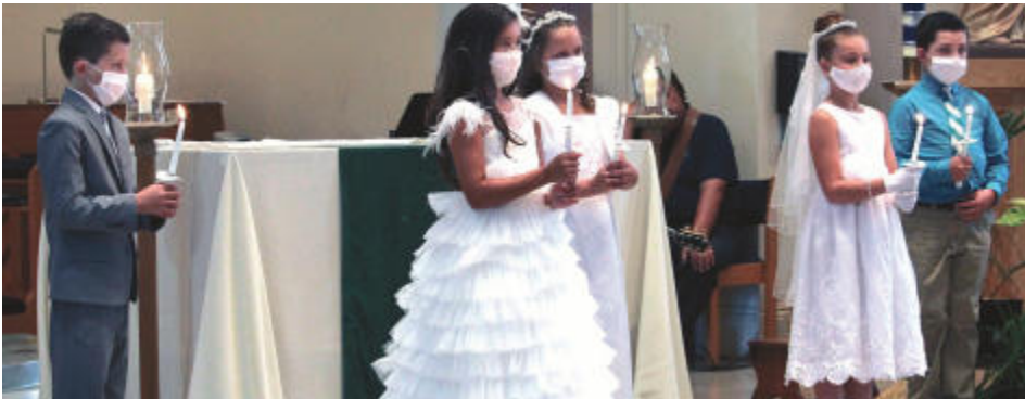
May is the traditional month for First Communion celebrations at St. Mary's. But in 2020, July and August were the new May, with this Sacrament celebrated at five different Masses – each one simple, yet unique and beautiful.