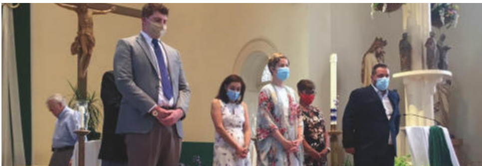
Five RCIA (Rite of Christian Initiation for Adults) candidates were welcomed into the St. Mary's parish family on July 26.