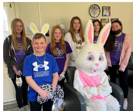
The JLOC stopped by Symphony Manor over the Easter season.