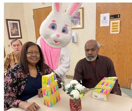
Residents of Symphony Manor, pictured above with the Easter Bunny, enjoyed treats, games, and prizes from the JLOC.