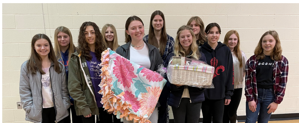
During their March meeting, the JLOC responded to pen pal letters from their 2nd graders at Buffalo public school #6 and made a gift basket for a Ladies of Charity Fundraiser.